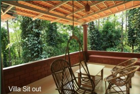
Villa Sit out