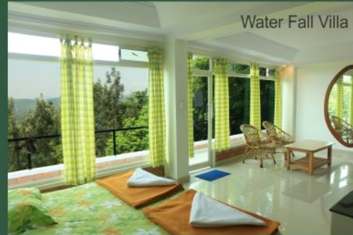
Water Fall Villa