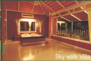
Sky walk Villa