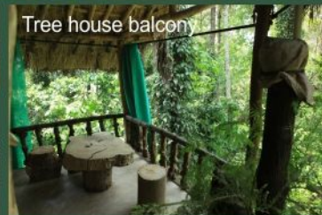
Tree house balcony